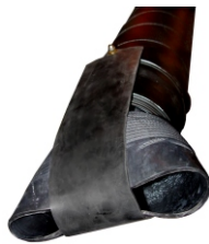
RETENTION HOLDING SLING