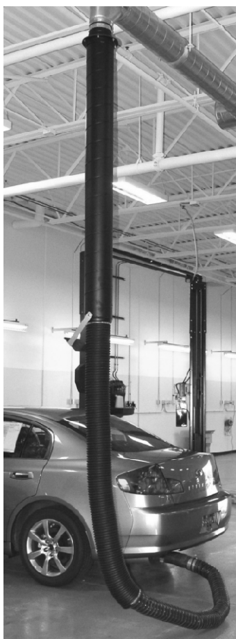
Car in service bay with telescoping drop in extended position and attached to vehicle.